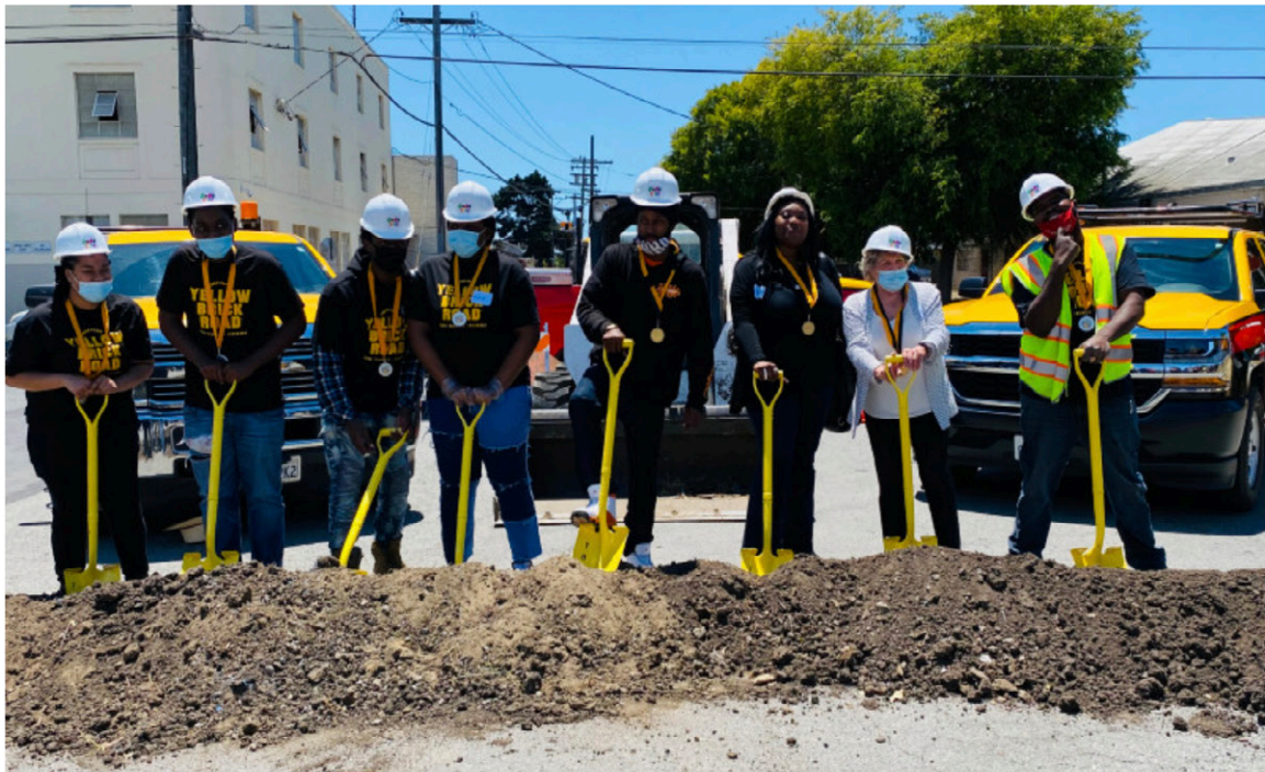
Community members gathered for a groundbreaking ceremony for the Yellow Brick Road project in the Iron Triangle in Richmond on Wednesday, June 9, 2021.