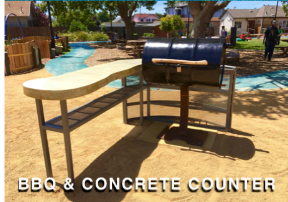
BBQ & CONCRETE COUNTER