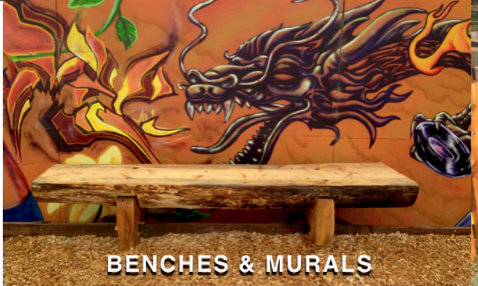
BENCHES & MURALS