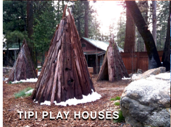
TIPI PLAY HOUSES