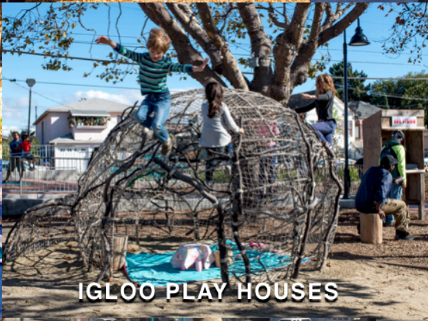
IGLOO PLAY HOUSES