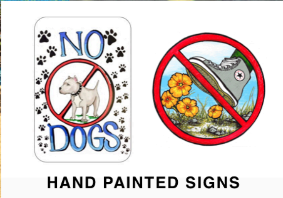
HAND PAINTED SIGNS