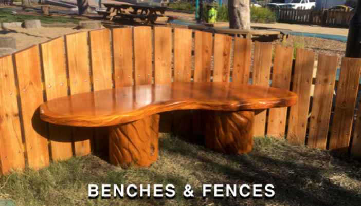
BENCHES & FENCES